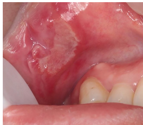
Fig. 2 Major recurrent aphthous ulcer. A 35-year-old female patient complained of oral ulcer recurring for three years, aggravated for one year, and accompanied by low-grade fever and fatigue. Examination revealed an ulcer with a diameter of about 10 mm×5 mm in the mucosa of the left lower lip, characterized as “red, yellow, concave, and painful” and covered by yellow and white pseudomembrane. The diagnosis was major recurrent aphthous ulcer.

Furthermore, fever is the first symptom of patients with coronavirus disease 2019 (COVID-19) (Jiang et al., 2020). It is an infectious fever caused by the invasion of severe acute respiratory syndrome-coronavirus 2 (SARS-CoV-2) virus. Low-grade and moderate-grade fevers are the main symptoms, and