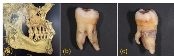
Fig. 3 Mandibular first molar with a small and curved distolingual root (DLR). (a) Three-dimensional (3D) reconstruction of mandibular first molars with DLR. (b, c) Lingual and distal views of an extracted mandibular first molar with a small and curved DLR.

The results of this study indicated that the length of PMFM-DLR had no correlation with bone loss at the lingual site or the periodontal parameters. Nevertheless, the length of DLR was important to clinical decision-making. In some cases, we found that the root length was less than half that of the distobuccal root, with curved root shape in DLR (Fig. 3). The presence of DLR can cause pain, swelling, and infection or recession of the gingiva at the lingual site (Figs. 1a and 1b). In this situation, it could be beneficial to obtain a