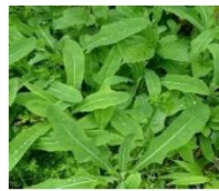
field sowthistle herb