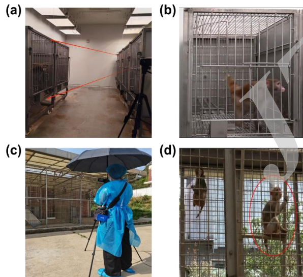
Fig. 2 Monkey daily behavioral data collection protocols