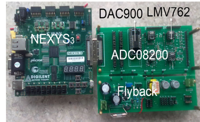
Test board of the proposed controller