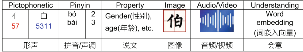
Fig. 1 Framework of Six-Writings multimodal processing (SWMP) for Chinese characters

To test our proposed methods, we design some analogical reasoning models (in which SWPC adheres to the grouping rules of Chinese words) and study some experimental situations, including processing of the Chinese analogical (CA8) data set (Li S et al., 2018). The analogical reasoning method answers all questions of the CA8-morphological (CA8-Mor-10177) data set and 12.05% of the questions in the CA8-semantic (CA8-Sem-7636) data set with 100% accuracy. The SWPC approach can also be used to fine-tune the results of word embedding and analyzes 39.37% question pairs in the Chinese word Similarity-960 (COS960) data set (Huang JJ et al., 2019). The relative error between similarity calculation and artificial basis evaluation is \leq 25\% . The analysis shows that our proposal embodies the delicate local representation and overall relevance of the Chinese language, and has the potential to supplement current CNLP theory and technology. Our study makes significant contributions in the following aspects: