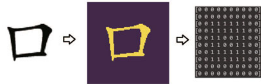
Fig. 6 Character 口 (mouth) by a 0-1 matrix

After processing and comparing the image of a new character (source) with each image of the root