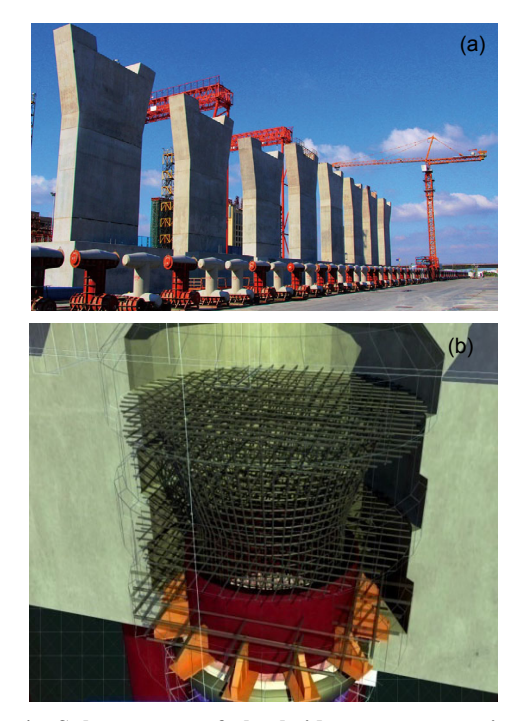
Fig. 4 Substructure of the bridges on non-navigable waters: (a) precast pile-caps and piers; (b) composite pile

hoisted to the construction positions by a floating crane, as shown in Fig. 6. Finally, they are combined with girth-welding, which is a high efficiency and good safety method for construction. The line shapes and stresses of the girder segments, however, must be strictly controlled during the whole construction phase to ensure the success of welding and positioning (Su and Xie, 2016).