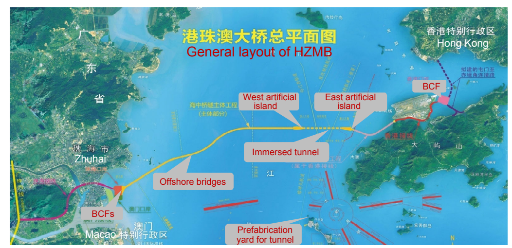
Fig. 1 General layout of the HZMB BCF: boundary crossing facility